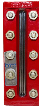
LG20-R (Reflex Style)

Liquid-Gas or Liquid-Liquid Interface Applications: Available in either reflex (Figure 1) or transparent