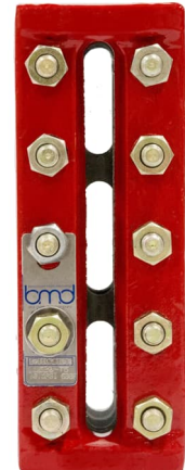
LG20-T (Transparent Style)